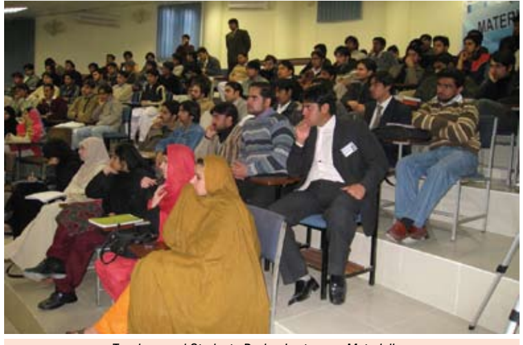
Teachers and Students During Lecture on Materialism

manner keeping in mind our religious beliefs and practices.