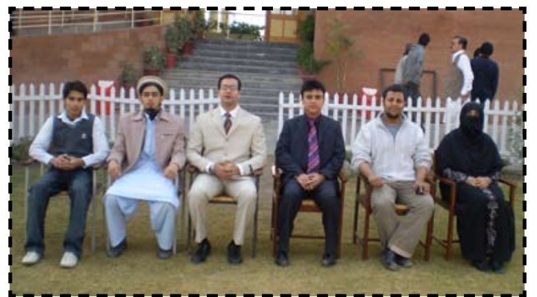
IM|Sciences' students who got four positions in HEC provincial debate competition with the supervisors

“It is indeed a great honor for the Institute that from N-W.F.P both the teams in English and Urdu category have been selected from IM|Sciences for the final round”, Director IM|Sciences