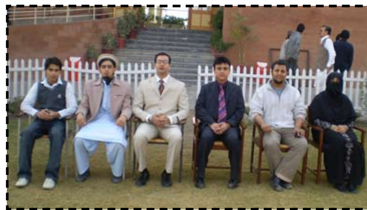
IM|Sciences' students who got four positions in HEC provincial debate competition with the supervisors

“It is indeed a great honor for the Institute that from N-W.F.P both the teams in English and Urdu category have been selected from IM|Sciences for the final round”, Director IM|Sciences