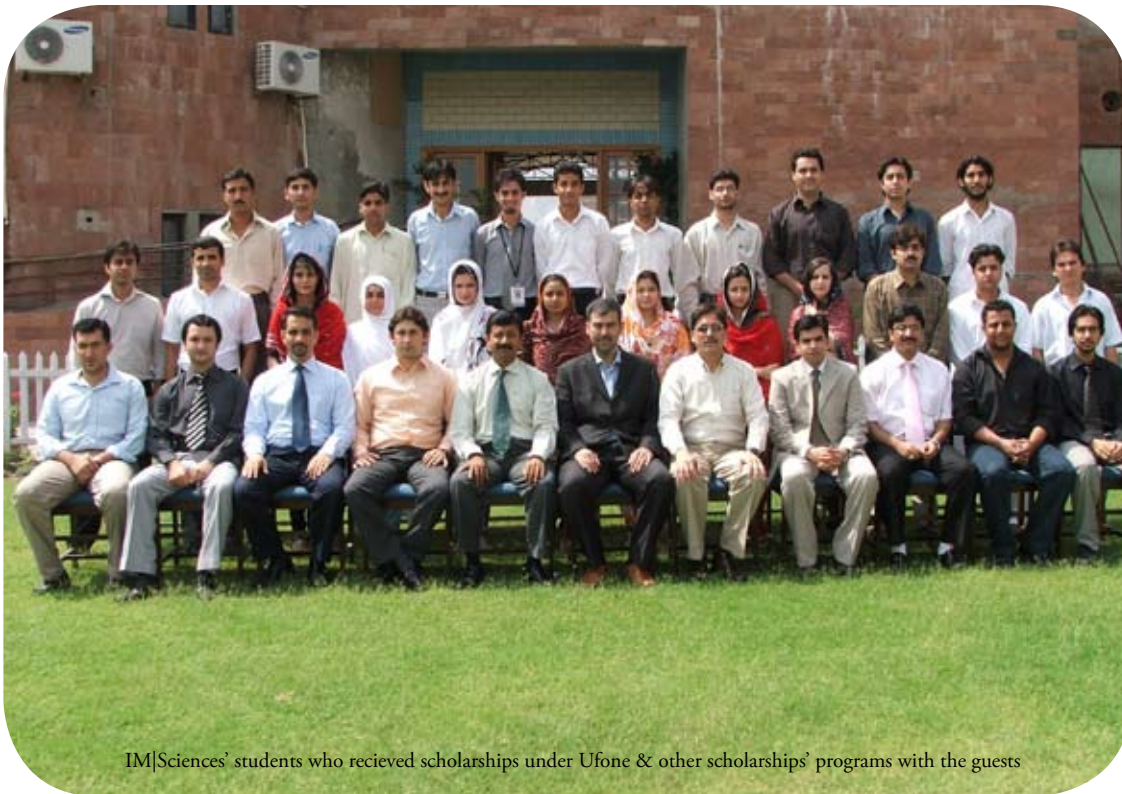
IM|Sciences' students who received scholarships under Ufone & other scholarships' programs with the guests