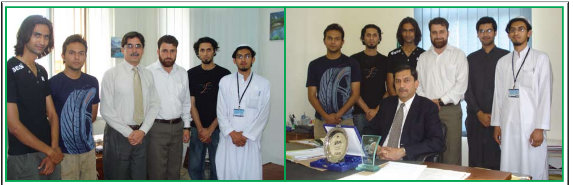
Social Committee’s members who organized IM|Sciences’ teams for LUMS Olympiad - 2008 with Director & Joint Director

the province has also drawn interest and enthusiasm.