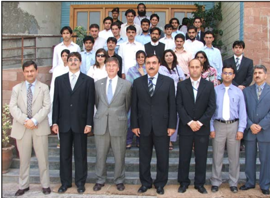
18 students of IM|Sciences who received Khushhali Bank scholarships for FATA with the guests