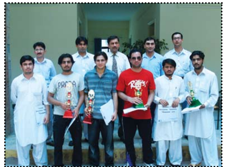
Winners and Organizers of Badminton Tournament